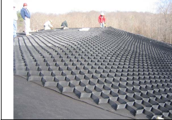
Gwinnett Heritage Facility Gwinnett County, Georgia