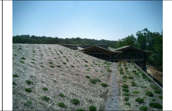
American Society of Landscape Architects Building Washington, DC